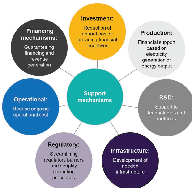
Figure 1: Illustration of support mechanisms divided into seven segments

In this study, subsidy mechanisms for offshore wind and green H 2 production were categorized. A subsidy mechanism is a financial or regulatory support system designed to incentivize the development, deployment, and operation of renewable projects [7,8,30,31]. Subsidy mechanisms can take various forms and are often implemented by governments, investors, or relevant authorities to accelerate the growth of renewable energy sources. These mechanisms aim to make renewable energy sources more financially viable, competitive with fossil energy sources, and conducive to achieve renewable energy targets. For this analysis, various attributes of each subsidy categorization were considered to identify groupings with similar characteristics (see Figure 1) [32–39]. The categorization process involved analyzing features to identify and ensure distinct subsidy categories. This framework facilitated an