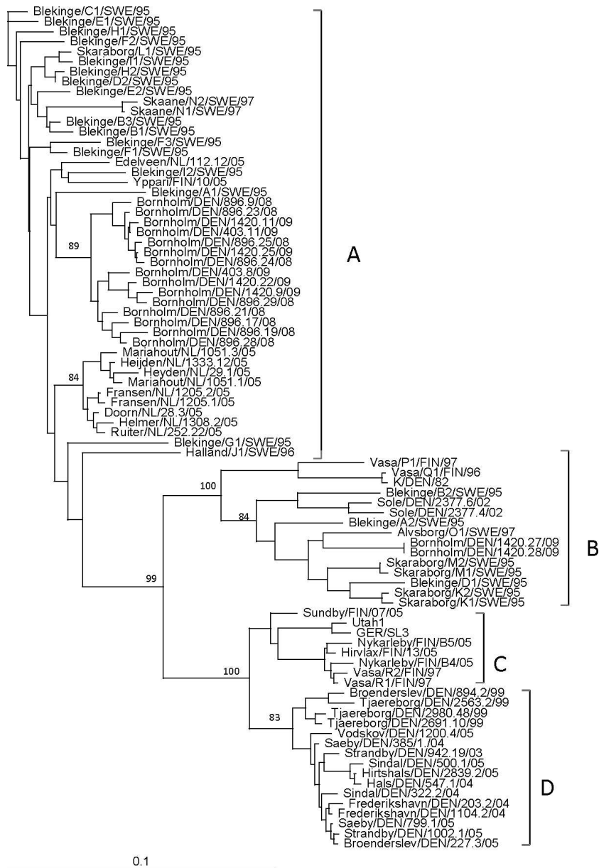
FIGURE 1. Phylogeny of the nonstructural gene (NS1) sequence of Aleutian mink disease virus (AMDV) from free-ranging mink ( Neovison vison ) from Bornholm, Denmark, showing clustering of the AMDV NS1 gene sequences into two groups. Groups as established by Olofsson et al. (1999).

2008–2009 from 57 mink and stored at -20^{\circ}\text{C} until analysis by PCR.