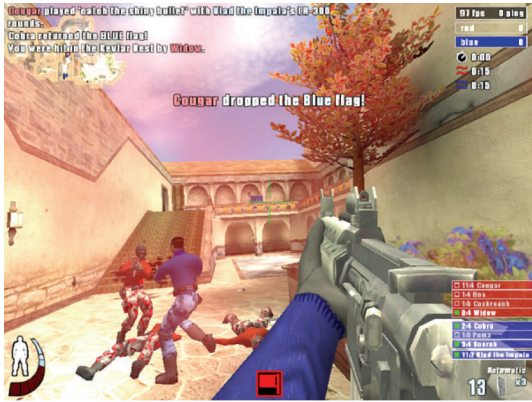
FIGURE 2: A screenshot from Urban Terror .

This paper extends a paper [4] presented by the authors at the Cybergames 2007 conference by exploring the implications of the conceptual framework described there for the future development of the audio component of game engines.