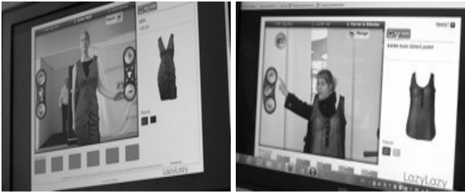
Fig. 3. Current UI problems (left; background triggering) (right; single handedness)