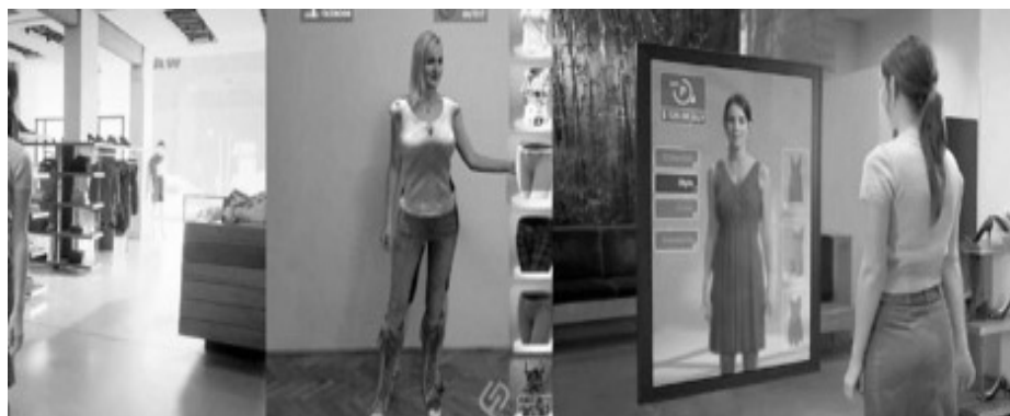
Fig. 1. Different state-of-the-art virtual dressing room solutions questioned

apparel purchasing system were seen as key factors for wheelchair-bound consumers. However, it is clear that the UI needs to be adaptive to overcome challenges such as illustrated in figures 2 and 3 that highlight interface/setup design considerations.