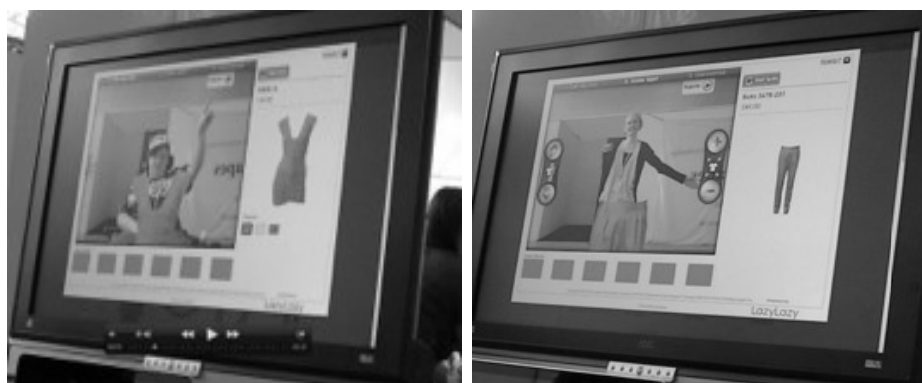
Fig. 2. Current UI problems (left; height/handedness) (right; distance view/operation)

Figure 2 (left) illustrates a participant who was in a wheelchair, which placed him lower in the picture than other participants. As a result, he could not reach the button at the top. He used solely his right hand to make selections, which provided difficulties when trying to reach the buttons on the left side of the screen. Younger children had similar issues with reaching as they were also positioned lower in the picture (due to their height). The figure 2 right image illustrates a participant who was standing too far away from the camera, which was necessary in an attempt to see her lower body and she selected to preview trousers. As a result, she had trouble reaching the buttons at the sides of the screen and the image was too small because of the distance. Figure 3 (left) illustrates how the participant had difficulties interacting with the system because the buttons were activated by motion (of other people) in the background. The right image (figure 3) illustrates persistent single-handed interaction and body twist to operate, even though participants complained it uncomfortable.