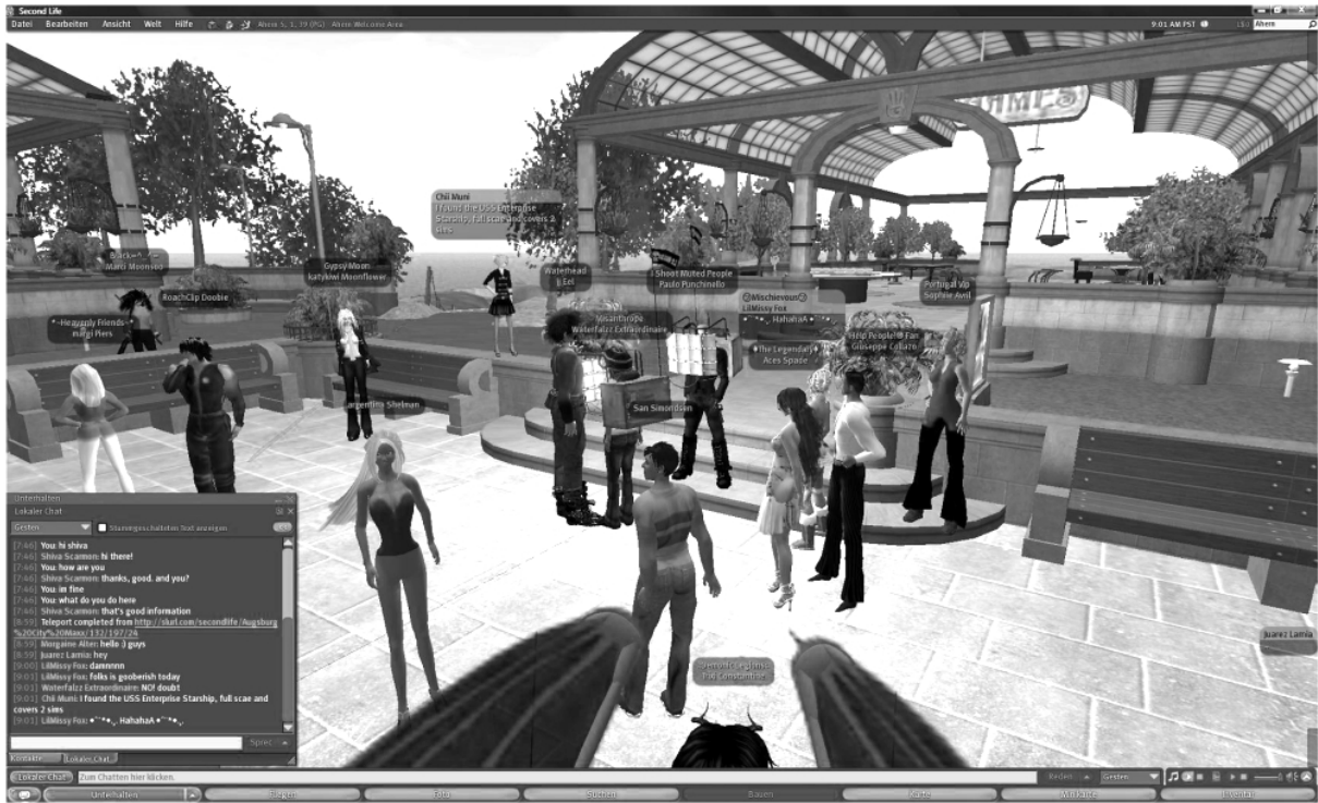
Figure 1: Snapshot from Second Life region Ahern.

The analysis revealed some similarities but also differences between the two settings. In real life as well as in Second Life, talk about the setting itself dominates the beginning of the conversation. The self presentation sequences are concentrating on the social affiliation and on biographical information. In most cases, a benevolent atmosphere prevails. But the Second Life chats also show some important differences. Topics are chosen predominantly from the area of Second Life itself. Moreover, topics are not discussed coherently but the conversations are characterized by frequent topic shifts. Most conversations are characterized by a thoughtless choice of words resulting in outwardly very informal conversations. Additionally, the conversations incorporate a number of standard chat slang as well as Second Life specific slang. Thus, users are frequently referring to abbreviations like lol (laughing out loud), ty (thank you) or yvw (you are very welcome). Specific to the Second Life setting are notions like residents (the users) or avi (avatar). Consequently, our agent has to be acquainted with these abbreviations and should use them itself.