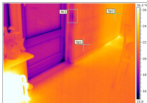
Figure 5. The transition between the wall and the floor is acceptable.

No leaks were registered in this door. The dark shades of the door indicate cold surfaces and a relatively large heat loss through the door. That corresponds to a high U-value, which is confirmed by Table 1, where the door is measured to U-value = 1.72 (Id 9) compared with the outer wall's U-value = 0.89 (Id 11).