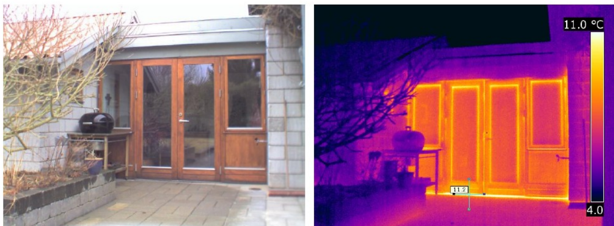
Figure 3. Poorly insulated window/door section along a corridor that connects the main house with an annex.

The U-value is measured to be U-value = 1.44 (Id 1, the wood parapet). The outer wall next to the wind/door section was measured to be U-value = 0.80 (Id 2). See Table 1 for measured U-values and corresponding identification (Id-numbers).