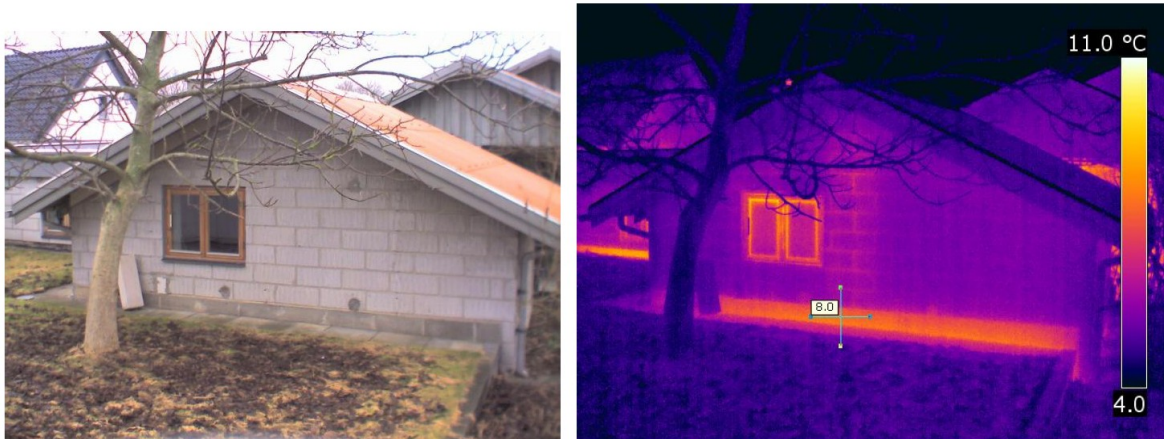
Figure 4. Gable (west) with window to the bedroom.

This room's outer wall was previously insulated from inside. However, a thermal bridge interruption was omitted along the floor concrete slab and therefore the socket shows orange on the thermography to the right. The U-value was measured to 1.03 (Id 19) compared with the insulated outerwall U-value = 0.32 (Id 22), see Table 1.