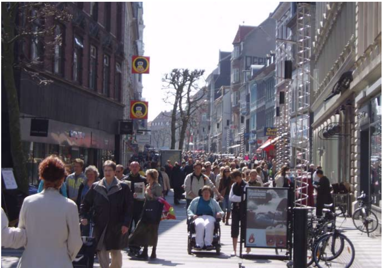
Urban success increases the use of the city's various places and spaces. This results in greater wear and tear, which requires ongoing maintenance, repair and renovation. Shown here, Søndergade, the main pedestrian street in Århus.

Conceptually, multifunctional urban spaces are designed to meet the need of all users. However, urban planners often have specific users in mind, and some work consciously to design urban space that appeals to selected groups. For although the general goal is to provide flexible, diverse and multicultural space, creating 'common space' is difficult in a time where