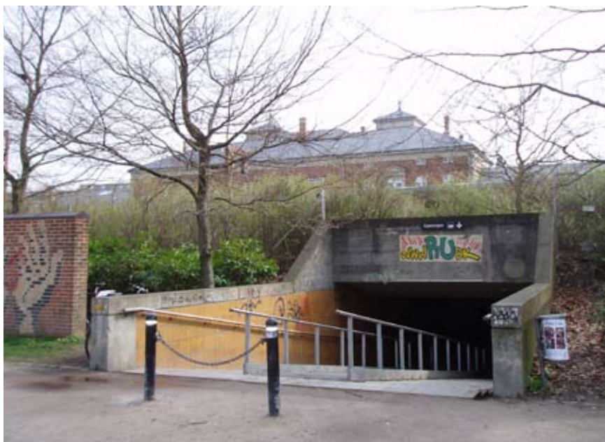
This dark tunnel connects a park with the railway station in Aalborg. Pedestrian traffic is heavy during the day, but at night the area is deserted and some people hesitate to use the tunnel.

Overall, the users who were interviewed in the study felt safe moving about the city. They cited 'personal familiarity with the area' as one of the most important elements of feeling safe and secure. Users expressed that the time of day has a major impact on how safe they feel, and that darkness alone gives a feeling of being