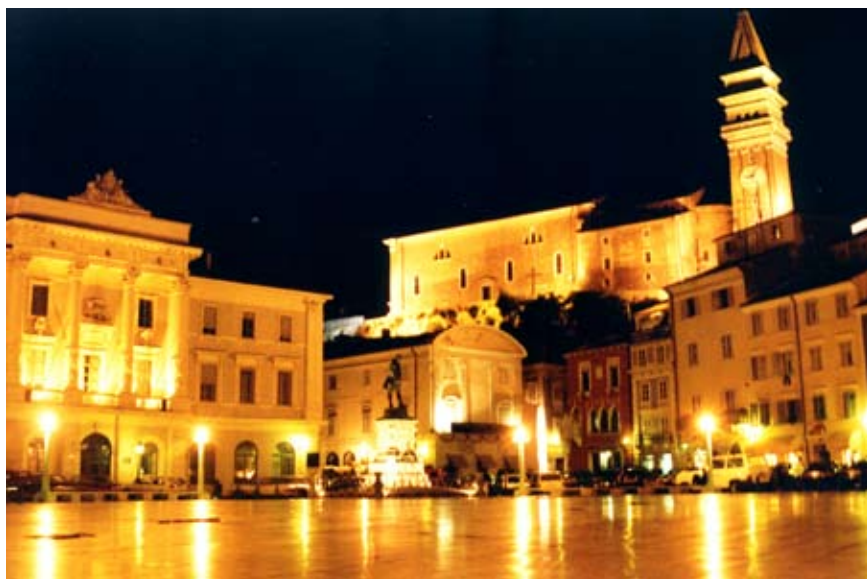
The good square in Piran, Slovenia.

interviewees who brought this up themselves. Many said they felt unsafe near groups of young people, especially ethnic minorities. Interviewees also referred to certain housing areas as 'unsafe', although their only knowledge of these areas came from the media and hearsay. No-one had ever personally visited the housing areas in question. Interviews with users show that assumptions about dangerous people and places have a significant impact on their feeling of safety.