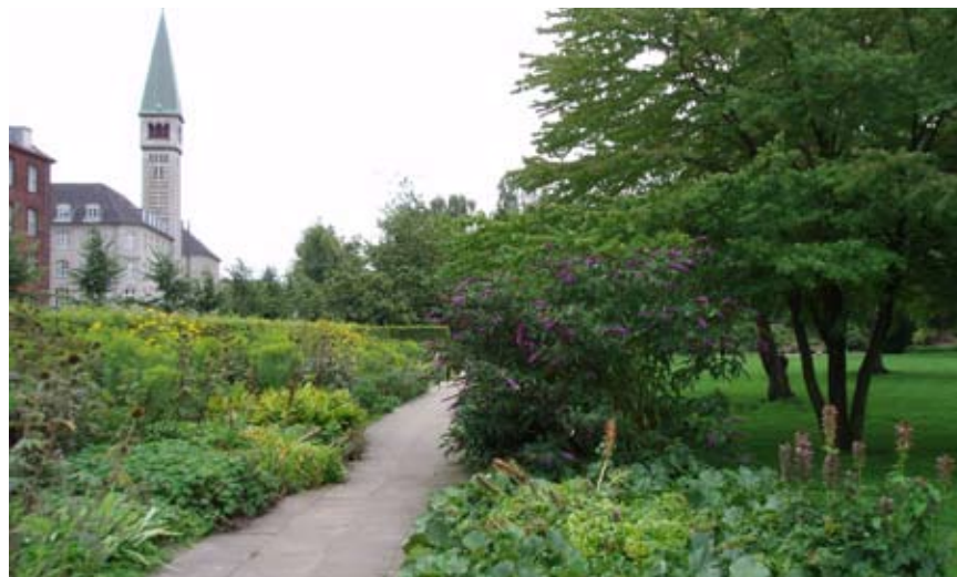
Although Enghave park is a green oasis in the city, it is a place some nonetheless avoid.

older people visit. In the evening, the users are groups of young people who have arranged to meet in the park. The park is often subject to vandalism and used by dog owners who organise dog fights there. There is a brisk trade in cannabis as well. Patrons of the nearby night club Vega often cause trouble here. The life that unfolds in the park in the evening makes many local residents feel extremely unsafe. Immediately adjoining Enghave park is a square, primarily used by beer drinkers who come every day. A circular hedge partially screens the square, hiding it fairly well from passers-by. The square is described as a safe place during the day but less so in the evening.