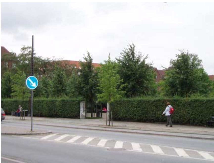
Tall trees, dense bushes and low visibility fuel the fear that someone may be lurking nearby. Shown here: Enghave park in Copenhagen.

and the police add that in some cases there is good reason to be on guard. Physical surroundings clearly influence the sense of safety, and poor maintenance such as litter, damaged benches, broken windows, graffiti and other types of vandalism signal unsafe environments. Deserted areas and narrow empty streets also make many users uneasy.