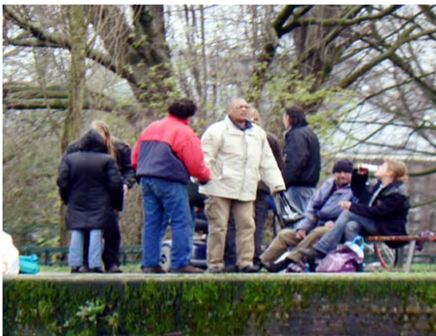
Marginalised groups, including the homeless, feel unsafe about occupying city squares, which are 'home' to them. Local authorities take different approaches to handling this group of users, but no one claims to have found an ideal solution.

Some cities have experimented with setting up shelters for marginalised groups outside the city centre, and consider that a good solution. Others see marginalised groups as part of city life and have attempted to design space with them in mind. Thus local authorities have different views on where it is most appropriate to designate space or shelters for marginalised groups. One view is that it is better to keep them in the heart of the city, because an urban core is better equipped to handle many different kinds of people. Alternatively, some decision-makers focus on moving 'problem' groups out of the city centre.