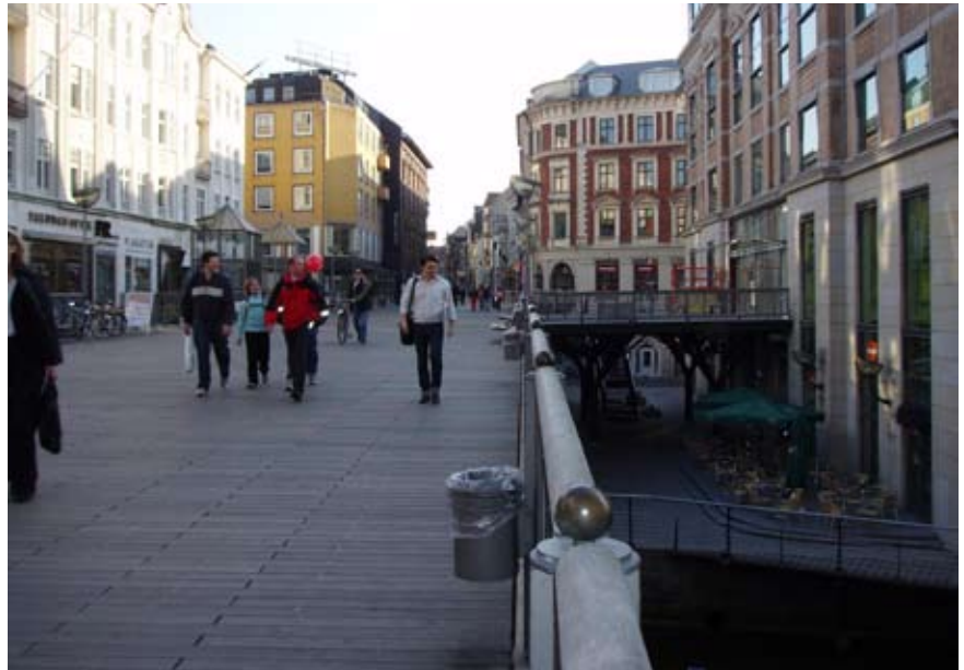
St Clemens Bridge affords a good view of city life by the river, but many people are deterred from using the area under the bridge because they cannot see what is going on.

When Århus Å was uncovered at the end of the 1990s, a special city area – Vadestedet – was created on the section from Immervad to St Clemens Square. Vadestedet houses a wide array of restaurants and cafés, with the focus on providing opportunities for outdoor activities in summer. The area attracts tourists and locals alike. The clientele changes several times over a 24-hour period: during the day business people eat lunch here, in the evening young families out for dinner are the main users, followed by university students enjoying a café latte or a beer. Around 10 pm the students go home, and the slightly more 'hard core' user group takes over. It is only after 10 pm and into the night that problems arise. From end-May to end-June and again from mid-August to end-September, police are on special alert in the area