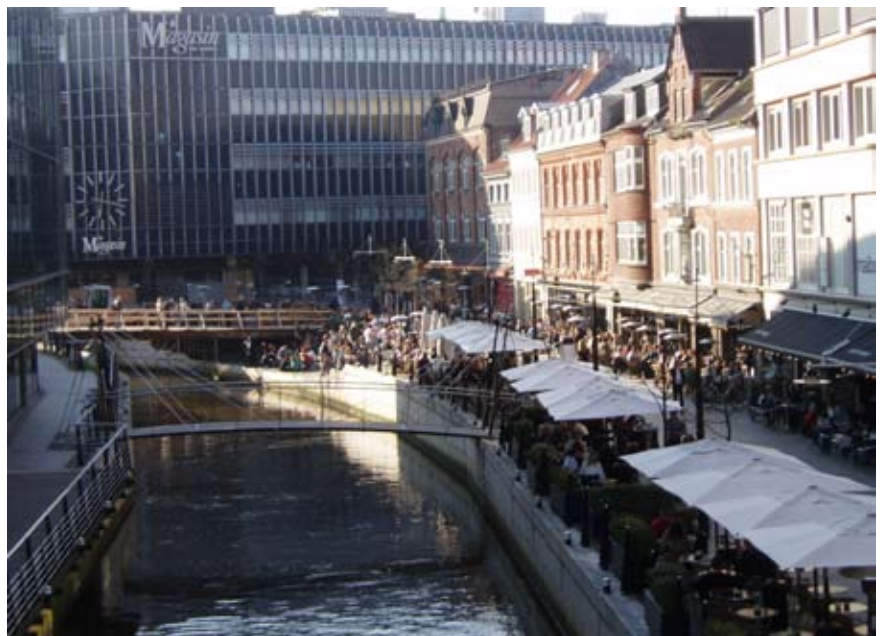
Cafés and restaurants one after another at Vadestedet.

insecurity'. The crime rate is fairly low relative to the large number of people in the area. Users describe the area around Vadestedet, St Clemens Square and St Clemens Bridge as a safe area and with 'good places' for passing the time of day.