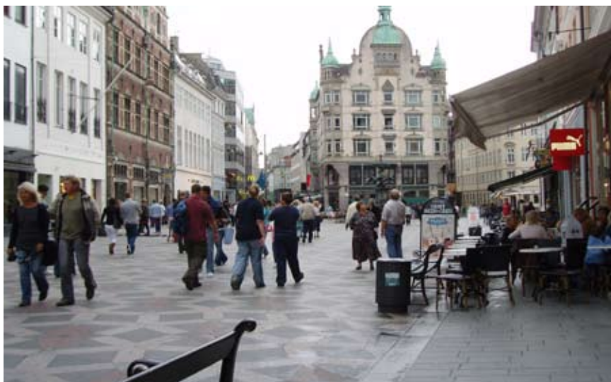
Many people use Strøget, Copenhagen's pedestrian street, and Amagertorv square. The countless shopping streets attract lots of people – including those who commit crimes such as theft and robbery.

Amagertorv in Copenhagen is a meeting place. It is a vibrant square with performing artists and numerous other activities that contribute to city life. Amagertorv boasts cafés, which appeal to the young and make it a hip meeting place. It also has a wealth of shops and is heavily frequented by tourists. Lots of people gather here, attracting others who commit crimes such as theft, robbery and street robbery. Violence occurs later in the evening, especially when people make their way home from the pubs to the town hall square to catch a night bus or to the central railway station to catch a train. This is a problem throughout Strøget, the city's main pedestrian street. It is typically drunks that are involved in violent incidents that mostly take place between people who already know each other or between those who have met in the course of the evening. An opinion expressed by all the people interviewed on Amagertorv was that they felt safe on the square irrespective of time of day. The square