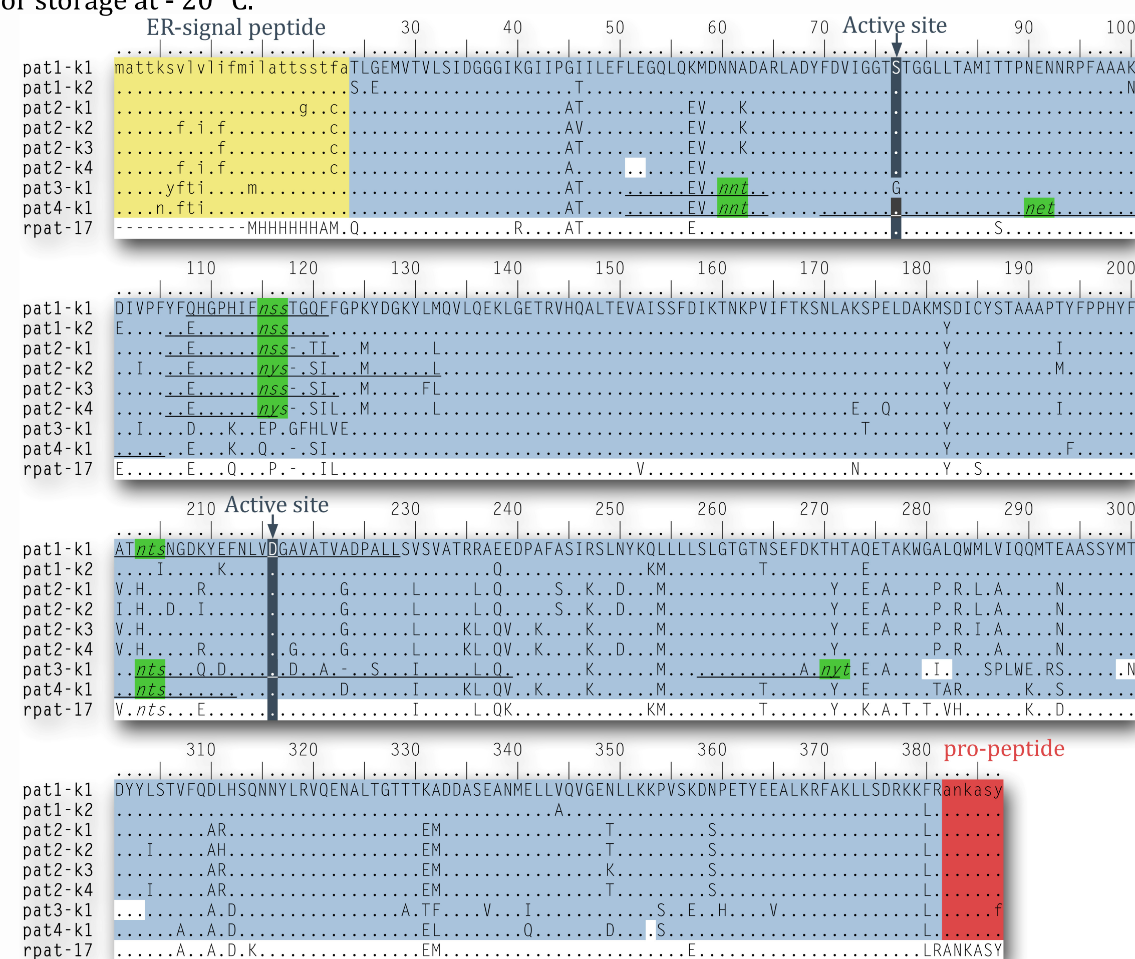
Figure 1. Alignment of translated patatin cDNA sequences using Kuras pat1-k1 as template

Proteolytic Digestions: MonoQ fractions were precipitated with ice cold ethanol to a final concentration of 60 % over night at - 20 °C which will precipitate patatins. Pellets were reduced and alkylated prior to digestion in 50 mM NH 4 HCO 3 , pH 8.0 with sequencing grade modified bovine chymotrypsin, or Lys-C. Samples were digested at 37 °C at E:S = 100:1 (w/w) for 30 min, and after addition of more protease (1:100) digestions were continued for 1 h and stopped prior to concentration by with vacuum centrifugation. Samples were analyzed by nanoflow capillary high pressure liquid chromatography interfaced directly to an electro spray ionization Q-TOF tandem mass spectrometer (MicroTOFQ, Bruker Daltonics, Bremen, DE), or storage at - 20 °C.