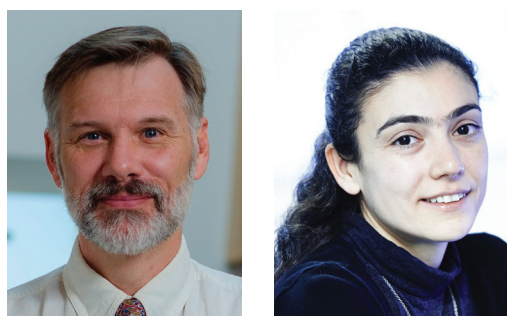
Brian E Cairns *1,2 & Parisa Gazerani 2