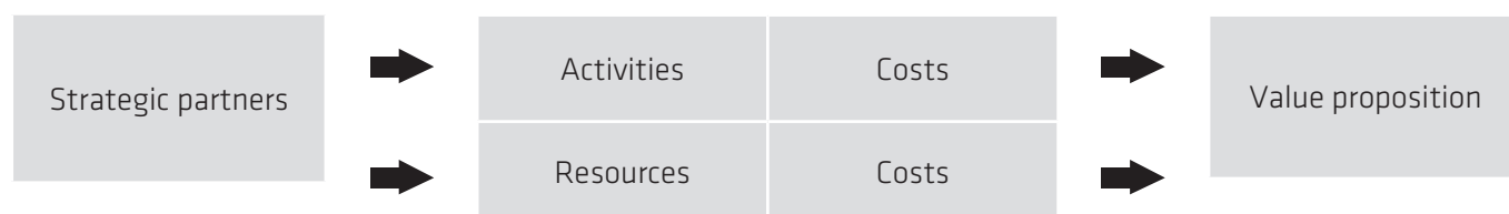
Figure 3: Two pathways to business model scalability

Business model thinking provides us with an alternative to business development, which should be considered by entrepreneurs or company managers. The configurations identified in the literature were found to be mainly related to strategic partners, cost structures, activities, resources and the value proposition of the company and in analysing the business model innovation in patterns one to five that led to exponentially increasing returns to scale, two routes emerged. Depicted in figure 3, we label these the two pathways to business model scalability.