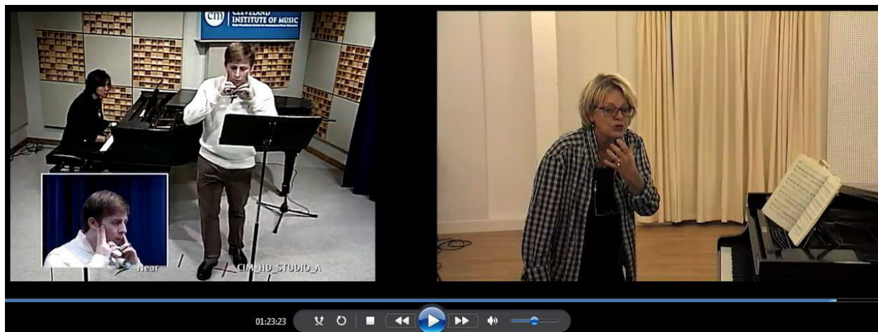
Figure 2: Split screen recording. The teacher and the student work with tensions in the student's jaw.

sessions this is remediated to extreme close-ups of facial details. Telepresent technology affords this but being object to or viewer of these extreme close-ups may personally and socially challenge the experienced telepresence and accordingly also the experience of the third teaching-room . The sound is another challenge as the voice sound is closely connected to the singer's body posture, control of breath and body movement. Therefore, it becomes an issue how different the transmitted sound is from its source in the far-end. Although Internet2 offers the highest quality of sound transmission, the physical acoustics in near- and far-end together with the technicians choice of representing the sound through mixing, affect the shared experience of sound in the third teaching-room and the participants' frame of reference. During a knowledge sharing workshop we learned that these issues are also relevant to wind instruments and even that some instrumental sounds are interpreted as noise by the telepresent technology and subsequently suppressed.