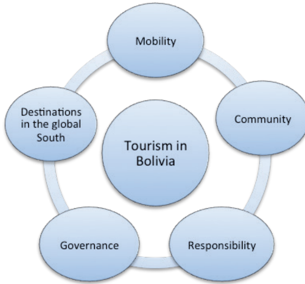
Figure 1 A comprehensive framework for studying tourism and communities