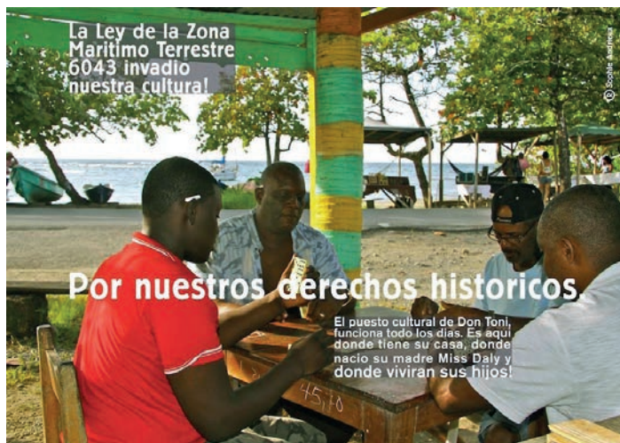
Figure 3: “The FCS’s banner against the demolitions”

Another of the FCS's goals is to get to know their history and cultural heritage. The FCS has been very active in this matter, some of the leaders of the group having done oral history to compile the stories of Puerto Viejo's oldest dwellers, and also organizing a public tribute to them to recognise their historical and cultural heritage. 30 In 2013, they organized an awareness campaign for the defence of their historical land rights and way of living, one of the mottos being “we were born and we live looking at the sea...we won't leave”, quoting the midwife of the village, Miss San. 31