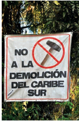
Figure 1: “No to the demolition of Southern Caribbean”