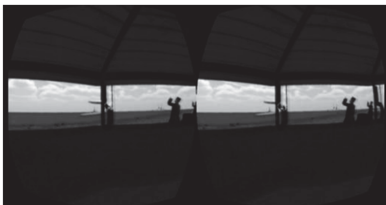
Figure 2: The virtual environment as seen on a normal screen. Soldiers are looking at the Zeppelin as it approaches the coast

In order to test the difference in retention based on the implicit and explicit mediation of information, an experimental research design was developed. Using the Oculus Rift VR HMD and the game development tool Unity, a virtual environment depicting Mosede Fort in Denmark as it looked during World War I, was created. In this VE there were several objects that the user could look at. This caused the objects to light up and activate a sound sequence that would then mediate a piece of information relating to the object, the fort or Denmark during World War I. Two versions of the VE were created. The first version mediated the information in an implicit way, where information for example was mediated in a conversation between two soldiers. The second version mediated the information explicitly using a narrator and pictures that would appear in the user's field of view. The VE had a total of 8 objects that could mediate information. A screenshot of the VE can be seen in Figure 2. Questionnaires were used to gather information after the experience; one using the NMES to determine engagement levels and one that tested the participants' knowledge about World War I and Mosede Fort.