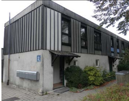
Figure 1. Facade picture of Albetslund Syd before renovation.

Gl. Jernbanevej. One block of flats with 5 floors erected in 1899 with brick walls. First floor accommodates shops. Other 4 floors have a total of 16 flats on 1139 m 2 floor area. Flats have an average floor area of 71 m 2 . It is the intention to add one more habitable floor on the roof level and use the generated revenue to finance an extension of the building envelope with added floor area, window area and insulation on the back side of the building. The renovation works was delayed and not initiated while the project was ongoing.