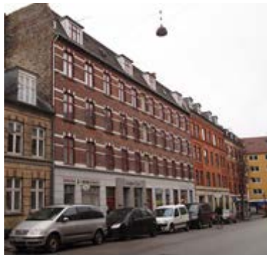
Figure 2. Facade picture of Gl. Jernbanevej before renovation and as of today.

Gl. Jernbanevej. One block of flats with 5 floors erected in 1899 with brick walls. First floor accommodates shops. Other 4 floors have a total of 16 flats on 1139 m 2 floor area. Flats have an average floor area of 71 m 2 . It is the intention to add one more habitable floor on the roof level and use the generated revenue to finance an extension of the building envelope with added floor area, window area and insulation on the back side of the building. The renovation works was delayed and not initiated while the project was ongoing.