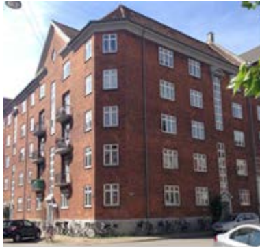
Figure 3. Facade picture of AB Bustrup.

Heating in all three cases was based on radiators with thermostatic valves under most façade windows. Supply temperature of the water based heat distribution system was adjusted by local operation staff at each building. Heat supply was water borne district heating. Hot tap water was also heated by the supply of district heating and metered together with consumption for room heating.