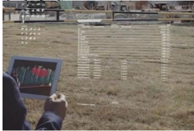
Fig 7 Building Information Modelling

design is increasingly being realized. Stretching the potential of BIM to the construction site and beyond is one of the B2S objective. In B2S will be used the BIM information to check whether the as-built situation complies with the designed – not just after the project is delivered but also during the construction process. Relevant information from the BIM will be made available on-site through the VCMP. These information will be compared to what the user can see, measure and test with the other technologies in development. Open BIM-dataformat IFC and the BIMserver platform will be adopted as the basis to develop interfaces with various other data formats (e.g. sensor data, measurement data, images) ([20] - [26]).