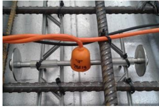
Fig 5 Example of smart-embedded building sensor