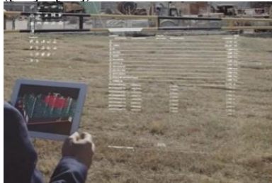
Fig 7 Building Information Modelling

design is increasingly being realized. Stretching the potential of BIM to the construction site and beyond is one of the B2S objective. In B2S will be used the BIM information to check whether the as-built situation complies with the designed – not just after the project is delivered but also during the construction process. Relevant information from the BIM will be made available on-site through the VCMP. These information will be compared to what the user can see, measure and test with the other technologies in development. Open BIM-dataformat IFC and the BIMserver platform will be adopted as the basis to develop interfaces with various other data formats (e.g. sensor data, measurement data, images) ([20] - [26]).