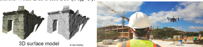
Fig 3 3D reconstruction – drone in action ([6])

Accurate and efficient monitoring of building during construction is an important issue to support fundamental activities such as progress tracking, construction control decision making, and construction dimensional quality control. Current monitoring techniques are principle based on manual measurements; time and labor demanding and therefore too expensive and unreliable to be comprehensively applied on sites. Past research in this area had proposed different techniques to automate this process. In the former case, a direct 3D to 3D comparison is performed between the point cloud captured by the scanner on site and the BIM model of the building. A semi-automatic technique is then deployed to detect what is congruent and what is not with the BIM model. In B2S image-based technique to detect geometric inconsistencies between the captured images and a model will be developed. In the focus will regard the development /calibration of semantic algorithm. This approach will be then applied at micro level using simple devices such as mobile scan (for detailed checks – e.g. rebars diameters; columns verticality,...), and macro level (at site level – e.g. to check construction progress; i.e. 4D comparison with 4DBIM) using UAVs (i.e. drones). Each aspect will be developed and then integrated into the VCMP for self- and user-friendly check/comparison with BIM model (Fig 3).