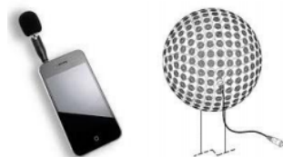
Fig 4 New acoustic devices and procedures in development

a maximum of 5 dB between bands. To be able to perform these acoustic measurements expensive equipment is needed, as well as a good technical background to be able to obtain the sound insulation indexes properly. To overcome this cost, there is a way to predict the sound insulation performance of a building using the UNE EN 12354 series ([7]). However, the difficulty to collect the dataset for calculating, and evaluating the uncertainty of the prediction model, provides a low accuracy and reliability. An alternative low-cost method to perform acoustical measurements in situ would overcome these drawbacks. In this sense to minimize costs and to make these technologies more portable and user-friendly the capabilities of smartphones as acoustic receivers will be explored ([8] - [12]). The aim is to develop a novel lightweight sound source for acoustic testing that provides a more diffuse field than standard loudspeakers and ensures easy portability and regulation compliance. An indoor positioning method is being developed to tag the location of the acoustic measurements. This is based on Bluetooth Low Energy beacons. This novel methodology will reduce the cost of experimental tests and be more suitable for self-inspection(Fig 4). All these aspects will be integrated into the VCMP.