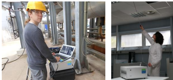
Fig 6 IAQ analyzer device in development

Current construction guidelines, procedures and standards for residential buildings usually do not focus much on IAQ or better inadequate for specifying materials and designing ventilation systems to ensure a healthful indoor environment - except in special cases like as an example LEED and BREEAM. In contrast the rapid introduction of new building construction materials and commercial products and inhabitants' awareness, pose challenges to systems integration in the whole building construction process from the design until the commissioning and "in-use" phase ([18]). As observed in [19] the choice of building materials strongly influence IAQ (e.g. sources of VOCs and formaldehyde). Particularly, the specific construction procedures implemented can have a major impact on IAQ in the building. Furthermore standard approaches require time consuming and high cost laboratory tests. Thus there is a real need to know in near-real time, anticipate and control emissions from building materials used to control thereafter the quality of the air inside the building in all construction phases in site. The ambition in B2S is to develop a truly portable device for in near-real time measurement of the pollution to be used by non-specialists, and simplified integrated IAQ indicator(s) for the end-user interface based on current knowledge, regulatory limits and health risks (Fig 6). All these aspects will be integrated into the VCMP.