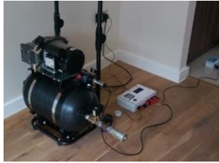
Fig 2 Device for air-pulse test in development