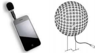
Fig 4 New acoustic devices and procedures in development

a maximum of 5 dB between bands. To be able to perform these acoustic measurements expensive equipment is needed, as well as a good technical background to be able to obtain the sound insulation indexes properly. To overcome this cost, there is a way to predict the sound insulation performance of a building using the UNE EN 12354 series ([7]). However, the difficulty to collect the dataset for calculating, and evaluating the uncertainty of the prediction model, provides a low accuracy and reliability. An alternative low-cost method to perform acoustical measurements in situ would overcome these drawbacks. In this sense to minimize costs and to make these technologies more portable and user-friendly the capabilities of smartphones as acoustic receivers will be explored ([8] - [12]). The aim is to develop a novel lightweight sound source for acoustic testing that provides a more diffuse field than standard loudspeakers and ensures easy portability and regulation compliance. An indoor positioning method is being developed to tag the location of the acoustic measurements. This is based on Bluetooth Low Energy beacons. This novel methodology will reduce the cost of experimental tests and be more suitable for self-inspection(Fig 4). All these aspects will be integrated into the VCMP.