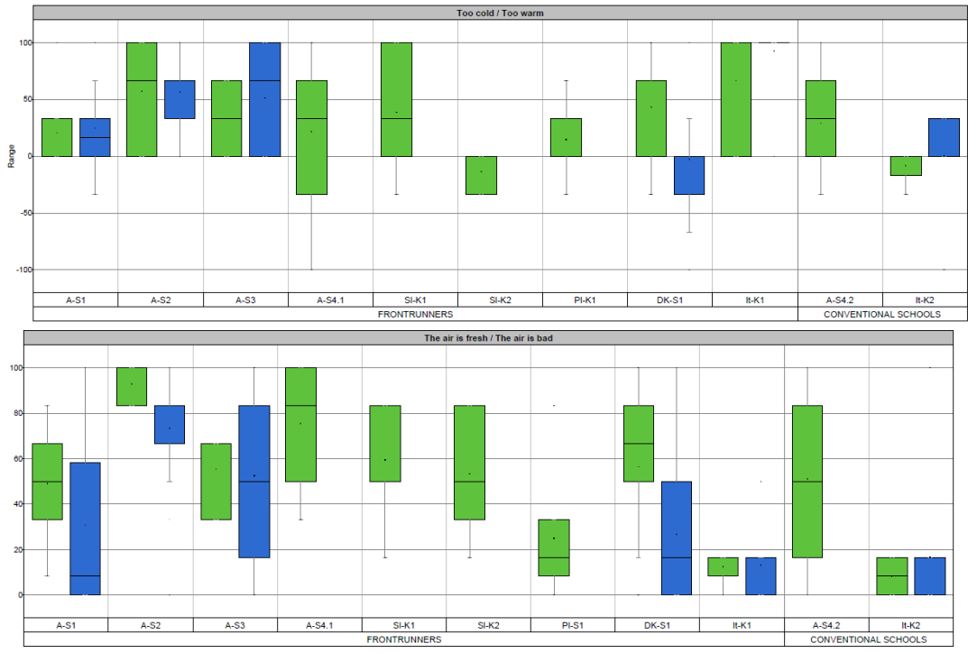
Fig. 3 Results of subjective evaluations of thermal sensations and air quality