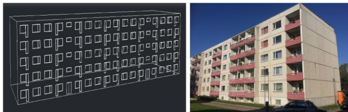
Fig. 1 Building model used in simulation

The modelling project was a five story dormitory building located in Riga, Latvia. A building model used for comfort and energy simulation with software "Riuska" is presented in Fig. 1.