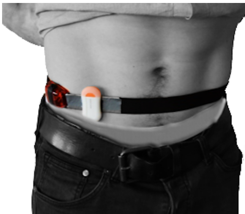
Figure 1 Accelerometer placement. ActiGraph is placed laterally to the right SIAS and the Motion Cookie is placed medially (Randomization 1).