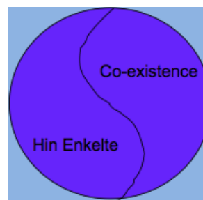
Figure 2. The double optic of the ying-yang relationship between “hin enkele” [14] (individual) and “co-existence” (collaborative) in a learning process

in order for a human being to develop harmoniously throughout a lifelong learning process (fig. 2):