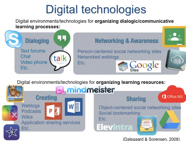
Figure 1. Technology support for digital learning [7]

On the positive note, research on the educational potential and affordances of digital technologies. Sorensen [3, 4, 5, 6] has identified the communicative affordance of digital technology and networks as a strong and promising resource for teachers to employ in learning designs, provided the teachers, pedagogically and technologically, are able to utilize it [7]: