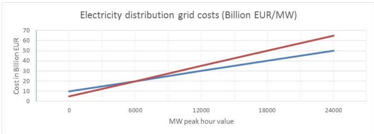
Fig. 1: Investment cost of electricity distribution grids as a function of the peak load in MW. The current grid in Denmark represent a peak load of 6,000 MW corresponding to an investment of 20 Billion EUR.

Here the above information has been put into cost-curves as shown in fig. 1. The curves assume a fixed cost of 5 and 10 Billion EUR respectively and relative costs so that the cost of the current distribution grid is 20 Billion EUR. The use of two curves illustrate the uncertainties related to these estimates.