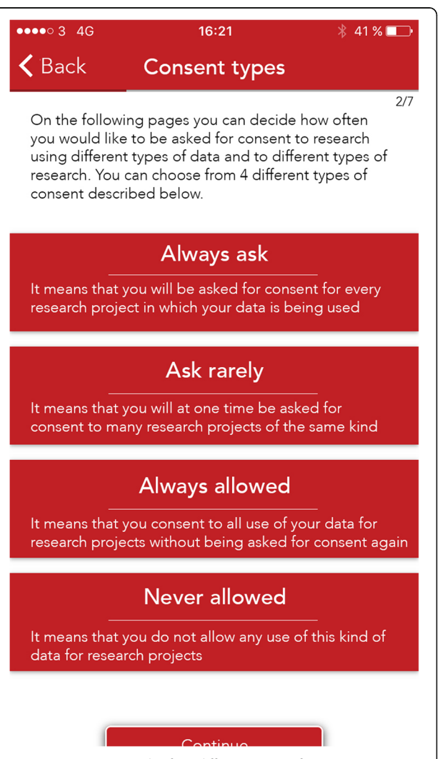
Fig. 1 Consent Types. The four different types of consent

These four criteria along with common user interface considerations formed the basis for the user-centred development of a paper prototype, a mockup and the final application for Android and iOS platforms by professional app developing company Syntac Studios. Figures 1 and 2 below