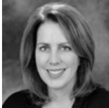
Sally Kingston Buck Institute for Education, USA