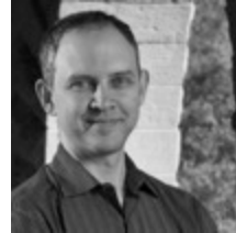
Paulo Blikstein Stanford University, USA