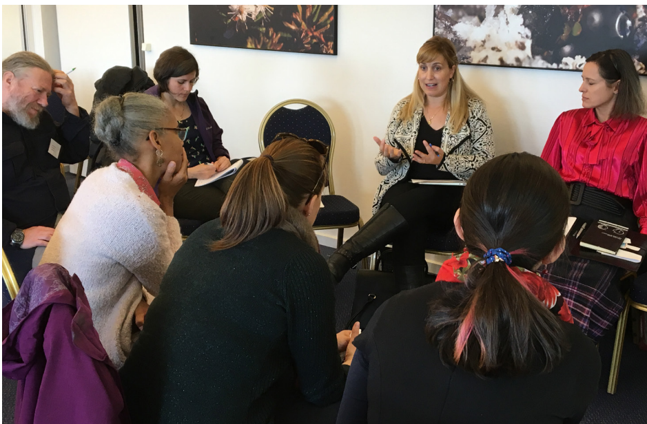
Photo 7, Group One

The concept of public housing meant very different things according to the country of origin of the workshop participants. In some countries, public housing generally has a stigma attached to it (this refers to the assumption that you are poor and that you do not care about the housing, since you are not its owner). The concept of housing is thus very context dependent. It was mentioned that it is very important to create venues such as this workshop, so as to be able to learn from each other and take new knowledge home, to share it with the community leaders in each Arctic country, and to create awareness about the problems and potential solutions that also were part of life in neighbouring regions.