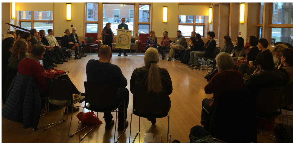
Photo 2. Talking circle, during seminar in Dartmouth, photo by Anne Merrild Hansen

A seminar at Dartmouth College was held in January 2016 6 . The seminar brought together additional experts and community perspectives on health care and delivery, infrastructure challenges, youth engagement, and traditional knowledge. The Dartmouth seminar was a consensus seminar featuring facilitated panel discussions by experts, breakout sessions, and non-traditional and holistic approaches, including a traditional Dene talking circle, to ground the academic discussion in the shared, first-hand experiences of community members and health care providers. The key determinants of community wellbeing that were identified included human capacity-building and local training, cultural connection, trauma, access to health care services, and self-determination.