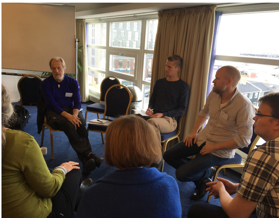
Photo 8, Group Two

The topic of self-determination arose in different ways. The group discussed how people make active choices, in such a way that the same things are not necessarily important to all. In other words, people are able to make choices according to priorities. There was much discussion about the factors that cause people to leave or stay in a community, and about the potential for conflict between individual self-determination and community self-determination.