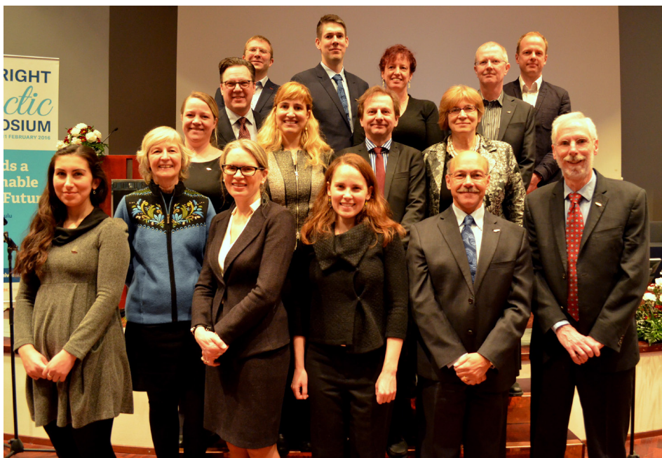
Photo 1. The Fulbright Arctic Scholars

Three working groups were established, on water, energy, and health and infrastructure, and bringing together 17 scholars from the eight Arctic countries.