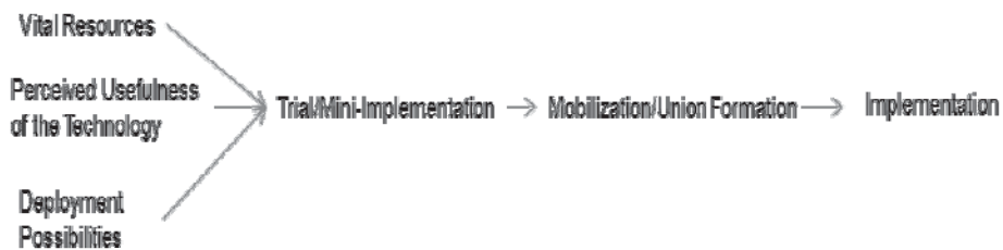
Figure 1. CBNM Model for Developed Countries