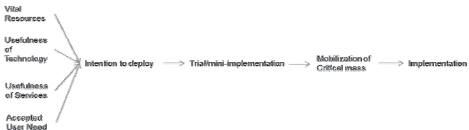
Figure 3. CBNM Model for Developing Countries

This loop continues until a critical mass of members was achieved to deploy the infrastructure. The existence of the iteration led to the process being christened the CBNM Loop for developing countries. The existence of this loop is as a result of the enthusiast, who believe and see the possibility of the project. Having explained the loop, the CBNM model for developing countries can be seen below.