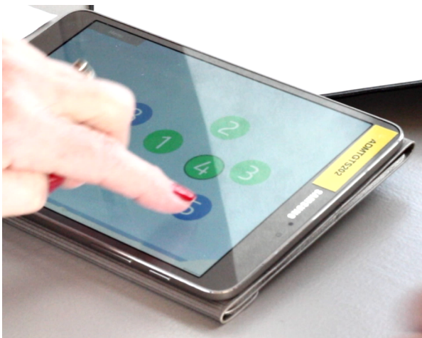
Figure 1. With TRAILiT (left) players connect numbered circles in a certain order to train their cognitive abilities such as attention. The timeline excerpt (middle) plots performance with colour and number

TRAILiT, a digital tablet app version of the Trail Making Test [5], has people visually search for and connect numbers or letters in a specific sequence. The app used visual and audio feedback when circles were connected correctly or incorrectly. After completion of one series of circles (level), TRAILiT congratulated, depicted the current training session duration, and allowed for continuation to the next level. TRAILiT progressed through levels increasing in difficulty