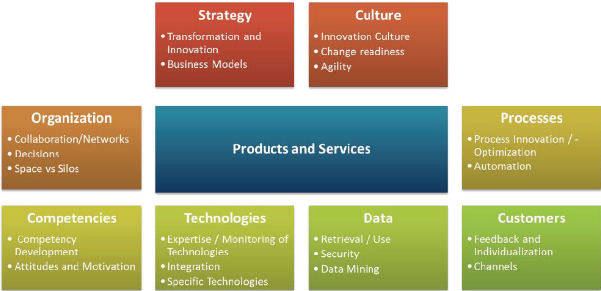
Figure 1: Digital Transformation Readiness

As a first step, it is necessary to understand the status of organizations in the digital transformation process. The following figure shows the key aspects and influence factors to be addressed.