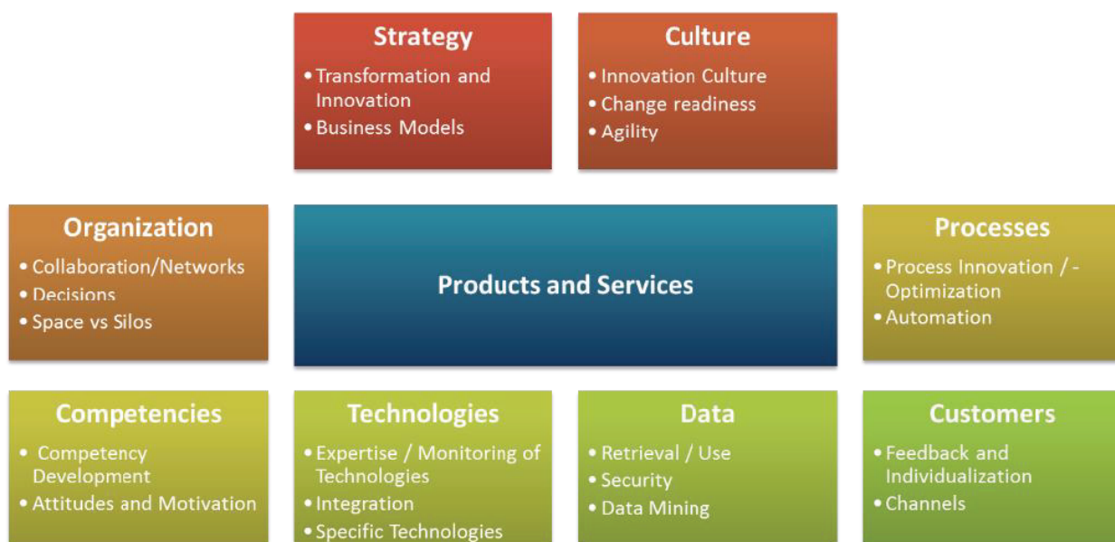
Figure 1: Digital Transformation Readiness

As a first step, it is necessary to understand the status of organizations in the digital transformation process. The following figure shows the key aspects and influence factors to be addressed.