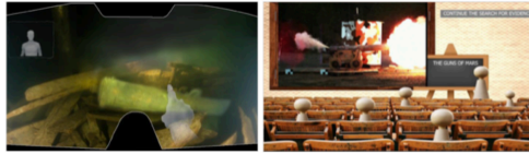
Figure 4 The final temporal sketches made to simulate interactivity from 1st person (left), and the overview of the pre-experience context of the VR application (right).

In this instance, what we thought would be a middle ground turned out to be the last step of the process - adding contextual details and narrative flow to the entire user experience of the proposed immersive concept as a whole. The temporal mediums were limited in terms of enabling true immersive VR exploration, but enabled the combination of many different types of visual materials to simulate the specific features the students lacked the ability to express through VR. Interestingly, almost all projects applying the temporal methods choose to show a bit of the context of use through these techniques, emphasizing the importance of not just thinking of the sketching for the immersion of the concept alone, but also address the 'before' and 'after'. Again, the temporal applications were assessed to have their own limitations, mainly that they had to be 'hacked' to work well for design sketching, and not just for traditional video editing. Furthermore, the static nature of video also left the students with questions still unanswered about the possible use cases which might arise with their concepts - not easily testable without realising full functionality in VR.