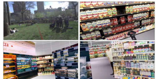
Figure 5 Stills from the immersive experience of being subjected to racism. The top left image shows the first scene, a park where police radio sound clips are played in the background. The other three pictures show the second scene, a convenience store where a person is following you and looking at you from behind shelves, with a heartbeat sound playing as the person gets closer.

ing and experimenting with the assets and functionality that were available in the tool instead of trying to force it to do what she had in mind. Another student was initially frustrated with the interaction space limits in VR, describing how she often got lost in the virtual world and ended "bumping into" the edges of the interaction space, seeing the blue grid signifying that a physical barrier is close by. However, when she decided to make use of the limitations, it inspired her to create an interaction concept where she took away the ability to teleport around in the virtual world and used the limited space as a way to convey the powerlessness of not being able to walk away when subjected to the racial injustice in her interaction concept. Thus, exploring the limitations of the software presented new creative constraints of 'being boxed in' which developed the concept even further; exploring the medium and tool became integrated into the sketching loop itself. Both of these examples could be thought of as a conversation with the sketching tool and not just with the sketch. By letting the affordances of the tool guide them, they set themselves up for "accidental discoveries" and used the limitation of the tools as a creative input rather than a hindrance.