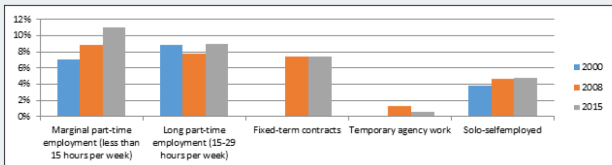
Figure 1: Recent development in non-standard employment forms in Denmark (2000-2015), percent of all in employment, 15-74 year olds

Source: Authors own calculations based on Danish LFS data.