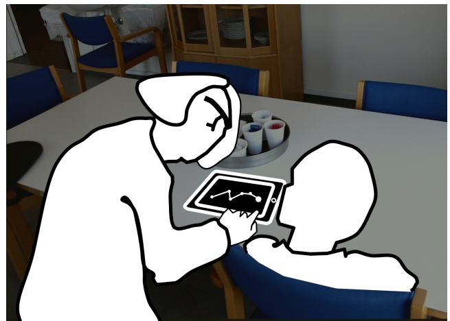
Figure 1: Occupational therapist storytelling illustrated in a cognitive training session context.

Over the course of three months, we collaborated with an occupational therapist at a regional neuro-rehabilitation center and observed her training sessions of 14 stroke patients suffering from poor focus and visual neglect. The therapist employed a tablet game Trail it and we learned how Trail it 's current presentation