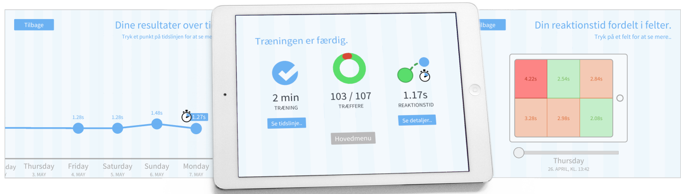
Figure 2: Trail it's aggregated data summaries & buttons leading to the timeline (left) and the heat map (right).

To address this, we re-designed an existing Trail Making Test [7] based rehabilitation game called Trail it (see [15, 18]). Co-design with an occupational therapist advised the re-design to include a heat map, timeline, and aggregate visualizations of patient performance. The visualizations enabled field observations of talk and actions between the therapist and patients training with Trail it in cognitive training. This paper contributes thematic analysis of interactions observed between therapist and patients across three months of cognitive training and derives design guidelines for enabling storytelling in visualizations to provide patient motivation and insight in self-care contexts.