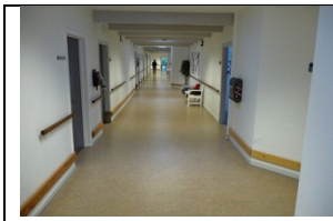
Fig. 2. A long white corridor.