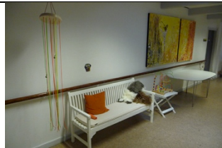
Fig. 3. Strings with beads and a bench