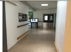
Fig. 4. Touchscreen at the end of the corridor.