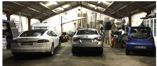
Figure 2. H1's garage. Three EVs had to be charged in sequence and overnight.

One of the more regular routines that we found in all households was to always begin charging their EV when returning home after a drive. This was often connected with returning home from work late in the afternoon. The purpose of this routine was to leave the EV charging overnight where its use was very minimal. To the households with only one EV, this was a simple activity, as the rule was that the person who drove the EV plugged it in when returning home. However, in the household with several EVs ( H1 ) we found that it was more difficult to schedule charging as the infrastructure of their house didn't allow multiple EVs to be plugged in at the same time (Figure 2): "Right now it's a practicality, but we can only charge one car at a time. If we charge two the fuses will blow" .