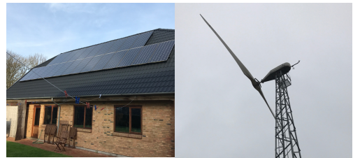
Figure 1. PV installation in H3 (left) and wind turbine in H4 (right).

At least one member of the households was very interested in the production and consumption of electricity. This member was very empowered to optimise consumption and who knew the exact amount of produced electricity without having to resort to looking at an app. It was also this member of the household who initially had suggested an investment in the electricity producing technology of the household (Illustrated in figure 1). Further, it was this member who kept up to date with production and ensured that the production facility was always produced at an optimal level. For example, as a member of H4 articulated: " I simply cannot ignore that our wind turbine is not running optimal, even if it's just for half a day. Even though we won't lose a lot of money on it it's still important to me, it was my idea to get it and I'm responsible for it running. I like it, then I get to tinker with all sorts of tech ".