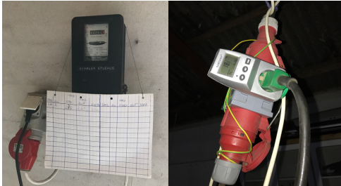
Figure 3. Examples of tinkering, additional power meter from H3 to keep track consumption (left) and homebuilt timer from H1 (right).

into homemade spreadsheets, as H3 explained: "I don't trust the numbers in the car, so I have installed a second power meter on my EV charger. I plot those numbers into a homemade spreadsheet and track that the numbers match" . Further, we also found homebuilt timers to automate scheduling charging between EVs, as H1 articulated: "I have created my own timer that tracks power consumption and starts charging our third EV when we're not home" . Examples of the homemade technologies are illustrated in Figure 3.