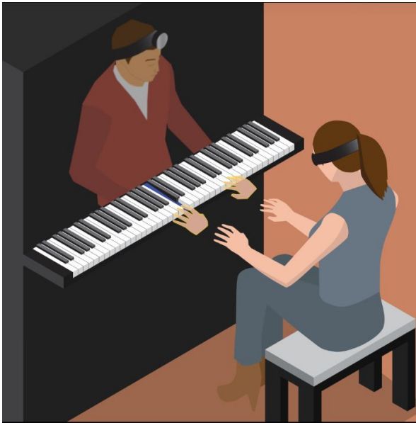
Figure 3. This figure is a model representing what the user sees inside the headset in the Mixed Reality environment. The user sees the virtual hands of the teacher on top of the physical keyboard. There is a blue highlight on the currently pressed key. The user also sees the face and upper body of the pianist in the reflection on the upright grand piano.

to get a binauralised sound source. All sound files were encoded to B-format thanks to Ambeo A-B Format Converter then decoded to binaural format through FB360 Converter.