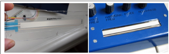
Figure 4. The friction PHOX implements a ribbon sensor, which lets the user slide his or finger back and forth over the surface to create energy.

multi-turn rotational potentiometer 4 and the rotational velocity of the potentiometer is mapped to the input energy of the physical model - the probability of a particle hit in the case of the particle PHOX.