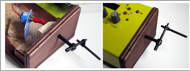
Figure 3. The crank is used as excitation controller for the particle PHOX. It is attached to a multi-turn rotational potentiometer.