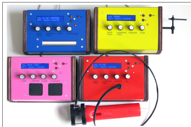
Figure 1. The PHOXES system is modular and currently implements four different modules each implementing a different physical model and a different excitation controller. Upper from left: friction PHOX and particle PHOX. Lower from left: drum PHOX and tube PHOX.

Copyright: ©2010 Steven Gelineck et al. This is an open-access article distributed under the terms of the Creative Commons Attribution License 3.0 Unported , which permits unrestricted use, distribution, and reproduction in any medium, provided the original author and source are credited.