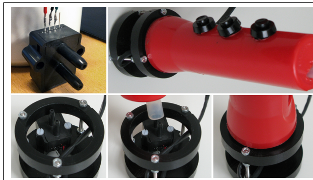
Figure 2. The flute controller is implemented using an amplified low pressure sensor mounted to the end of a tube, which the user blows into.

As described in Section 1.1 the PHOXES have been inspired by commercial electronic music instruments. It was important that the eventual test environment was as natural for the test subjects as possible, which is also why the PHOXES were designed with a look and feel that were convincing enough to resemble real commercial hardware synthesizers. The PHOXES could have been presented