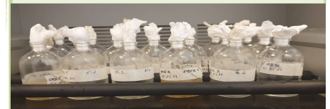
Testing of 6 bacterial isolates in M9 media supplemented with Dicamba 50 mg/L, working volume 20 mL.