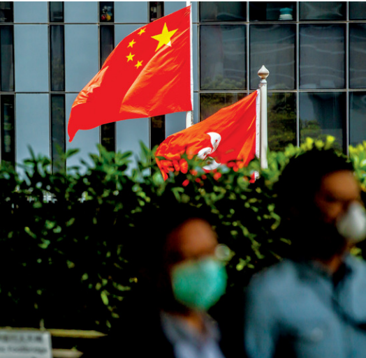
The election system is to be overhauled to ensure only patriots can govern Hong Kong.