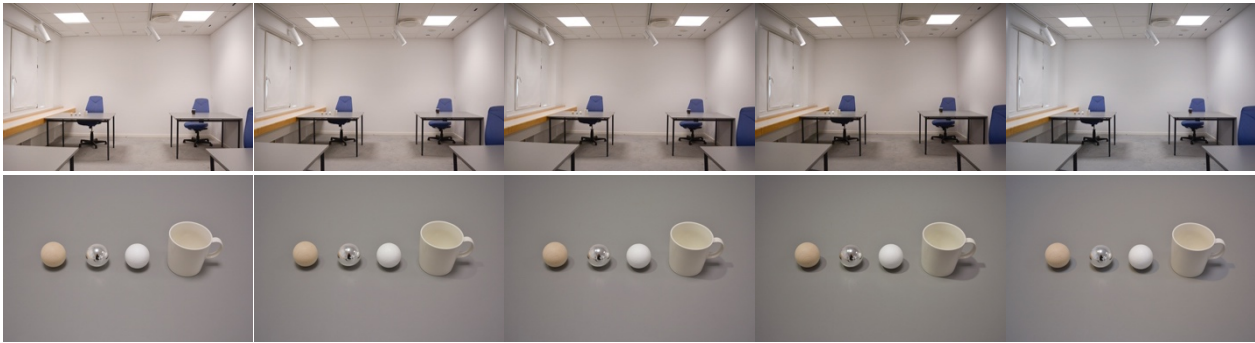
Ill. 1. Ex1 lighting scenarios from left: 1.1, 1.2, 1.3, 1.4 and 1.5, illustrating the light distribution and perceived CCTs of the space and of objects on a work desk.

The lighting scenarios were evaluated through questionnaires, where 30 test participants, assessed atmospheric appearance, perceived distributions, comfort and glare. In order to reveal the motivational aspect in relation to the different lighting scenarios, participants were asked to evaluate their preference in working under the different lighting scenarios and what tasks they found appropriate. The participants were also introduced to 30 statements, out of which they were asked to mark five characteristic statements for each scenario. This approach is based on the Product Reaction Cards (Benedek and Miner, 2002) i.e. used to assess engagement in playing computer games. (Schønau-Fog and Bjørner, 2012).