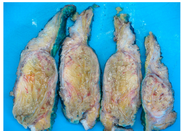
Fig. 4. Gross image of the tumour and the breast.

index showed low proliferation ratio. The biggest part of tumour was necrotized. There were no signs of malignancy. Tumour was removed radically.