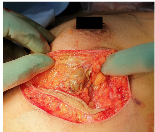
Fig. 3. Patient underwent successful nipple-skin-sparing mastectomy with immediate silicone implant reconstruction.

The patient was discussed at the Multidisciplinary team (MDT) conference. Because of the tumour size, it was decided to perform nipple-skin-sparing mastectomy with immediate silicone implant reconstruction (Fig. 3). The surgery was performed by experienced breast surgeons in a collaboration with a plastic surgeon. Final histopathological examination confirmed benign phyllodes tumour diagnosis (Figs. 4, 5). It was found to be a well-defined, encapsulated biphasic lesion with typical leaf-like pattern with low stromal cellularity. There was no atypia and no mitotic activity. Ki67