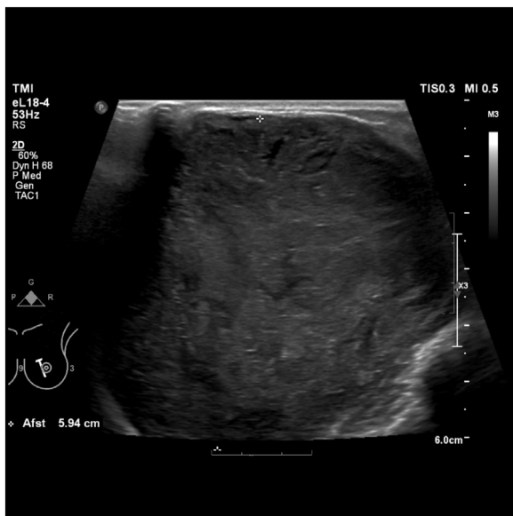
Fig. 1. Ultrasound revealed big cystic lesion on the left breast.

was repeated. This time it showed an acute and chronic inflammation, without malignancy. It was decided to perform an excisional biopsy, because there was no correlation between the histologic diagnosis and the imaging findings.