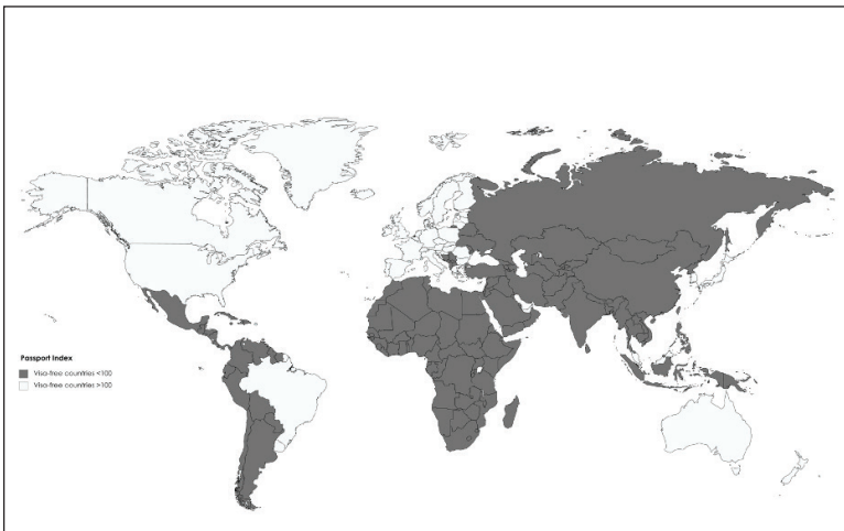
Figure 1 Yussef Al Tamimi on the basis of Passport Index (2017/2021)

This inequality is evident from a visualization of the Passport Index (Figure 1 below), showing in white the nationalities which need an entry visa for less than 100 countries, and in black those needing a visa for more than 100 countries (Spijkerboer, 2018). The introduction of carrier sanctions means that visa requirements are enforced within the black countries on the map.