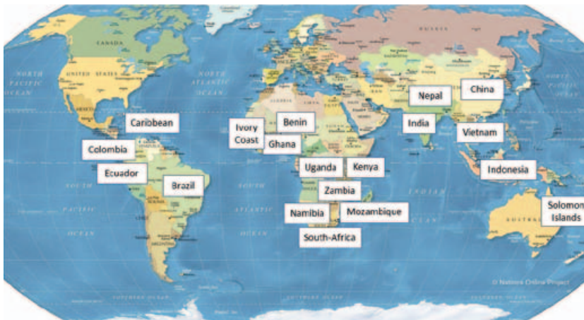
▲ Figure 2: The FFPLA country assessments and implementations addressed in the special issue.