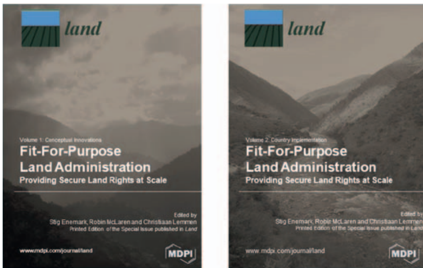
▲ Figure 1: The two volumes of the FFPLA books.