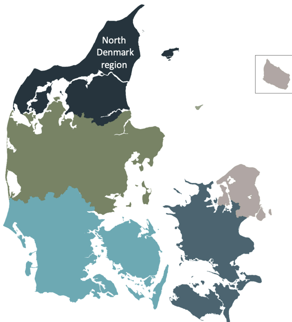
Figure 1 A map of the Denmark. The North Denmark Region is marked with black.

Medical care is tax-supported and free of charge for all residents in Denmark. A unique civil registration number is assigned at birth, which allows for a unique identification of all Danish residents and an unambiguous linkage of individuals between registries. 10 In the North Denmark Region, an outpatient clinic for patients with long-COVID was established on January 1, 2021 at Aalborg University Hospital (Figure 1). The catchment population was 590,439 (January 1, 2021) and 21,727 had tested positive for SARS-CoV-2 in the North Denmark Region during the study period. 14,15 Patients eligible for consultation at the hospital outpatient clinic were required to have had symptoms for >6 weeks and a previous SARS-CoV-2 infection documented by a positive polymerase chain reaction (PCR) test on a respiratory sample or a positive serum antibody test. In addition, all patients admitted with acute COVID-19 infection requiring oxygen treatment were invited to a follow-up examination at Aalborg University Hospital.