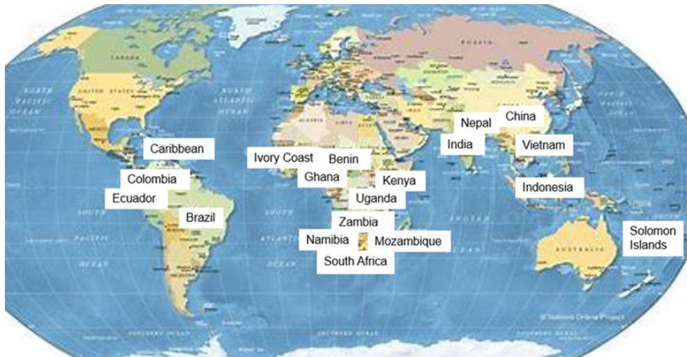
Figure 2. FFPLA Country assessment and implementation addressed in this special issue

This Special Issue provides an insight, collated from 26 articles, focusing on various aspects of the FFPLA concept and its application. It presents some influential and innovative trends and recommendations for designing, implementing, maintaining and further developing FFP solutions for providing secure land rights at scale. The first group of 14 articles is published in Volume One and discusses various conceptual innovations related to spatial, legal and institutional aspects of FFPLA and its wider applications within land use management. The second group of 12 articles is published in Volume Two and focuses on case studies from various countries throughout the world, providing evidence and lessons learned from the FFPLA implementation process.