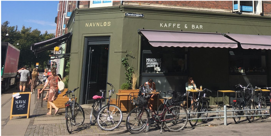
Fig. 1 Copenhagen is becoming increasingly popular as a place of residence, especially high-density inner neighbourhoods like Vesterbro, where this photo was taken. In urban areas, housing prices are spiralling, and there is an increasing lack of affordable housing. Photo by author (also published in Winther, 2021)

housing (European Commission, 2020). In Copenhagen, these developments have accelerated due to the city's increasing share of high-income inhabitants. This challenges housing conditions, even for the middle-class, and gives rise to concerns that Denmark's high housing standards will be squandered. Dwelling sizes play a key role in this regard, as physical spaciousness has been a core element in ideals of good housing from the offset. City of Copenhagen has set minimum size requirements for housing units in new developments (City of Copenhagen, 2019), and Denmark has the second highest average for floorspace in the EU (Eurostat, 2018). Thus, introducing urban compact living is highly controversial, as experienced in many countries (Waite, 2015), but extensively in a Danish context. This paper aims to explore the role of the city for housing choice processes in the field of urban compact living, where macro-scale norms of good housing as spacious housing are on the table.