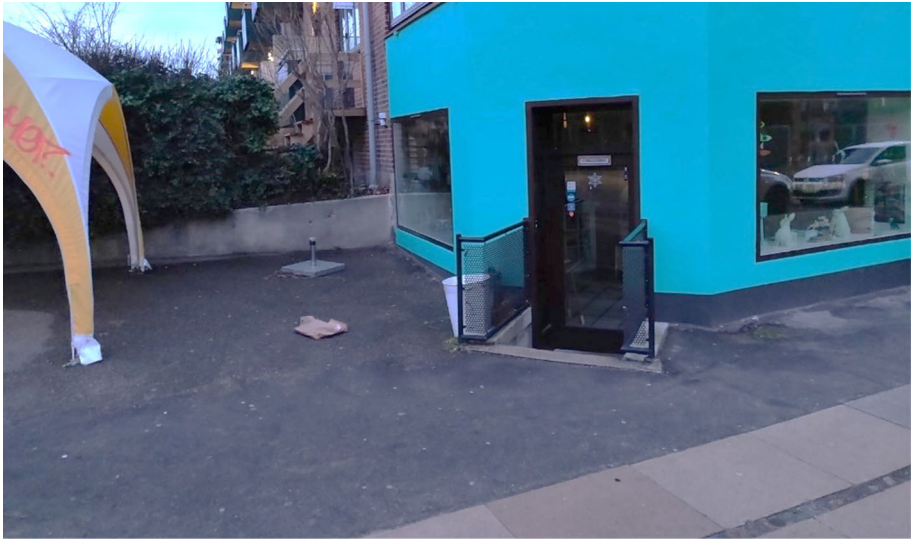
Fig. 6 The coffee shop Madsens Mekka in the Copenhagen neighbourhood Nordvest is one of the best features of the area according to the household of Case #2. “Nearby and child friendly. Good when the weather is nice”, they say. (also published in Winther, 2021)

This case study thus shows how the city is key to the lifestyle of the households, and accordingly, that living in the city becomes an essential priority. Yet due to the high-pressure housing market in Copenhagen in recent years, living in the city increasingly entails quite substantial compromises on other priorities for middle-class households. In the specific context of urban Danish compact living, it is thus worth examining whether this essentiality of living in the city is profound enough for the households to make such substantial compromises, or whether things are more complex. Examining their processes of making home and their imaginaries of what an appropriate home is, it is clear that the households are aware of diverging from macro-scale ideals of the home. Case #1 even tried the mainstream choice, as they previously lived in a suburban neighbourhood in a provincial town. Here, they could afford a spacious terraced house with all the amenities they attributed to a proper family home: