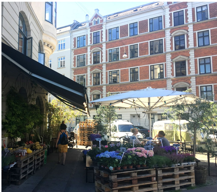
Fig. 5 The case study households' attachment to the city is strongly bound up on a profound appreciation for the ambience of the urban neighbourhood. This picture depicts a popular local hangout in the Copenhagen neighbourhood Vesterbro, functioning as a specialties shop, a grocerer's, a café, and the location of events like flea markets, concerts, and social events. Photo by author (also published in Winther, 2021)