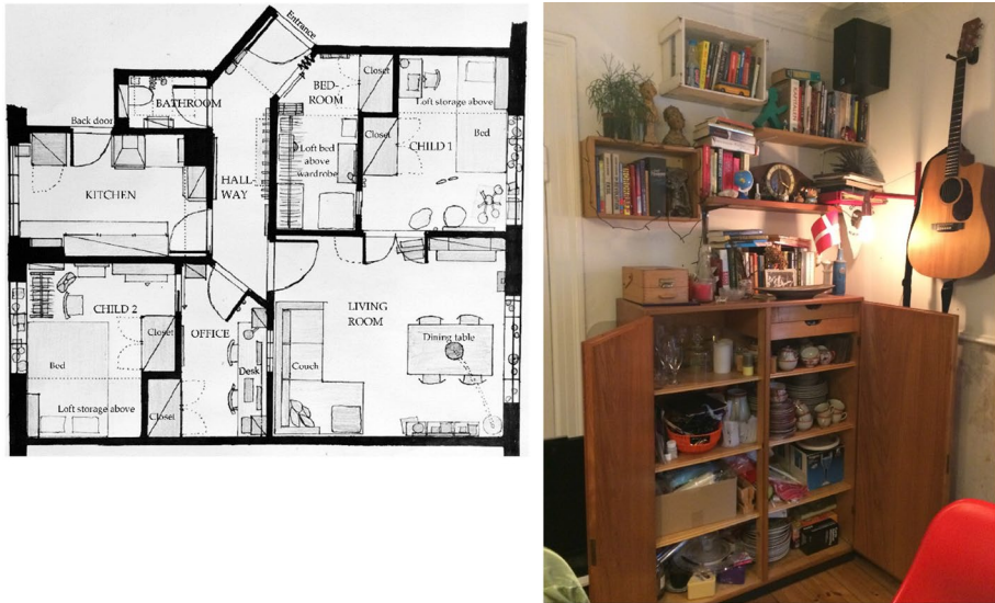
Fig. 2 Case 1, plan and photo from the flat. Illustration and photo by author (also published in Winther, 2021)