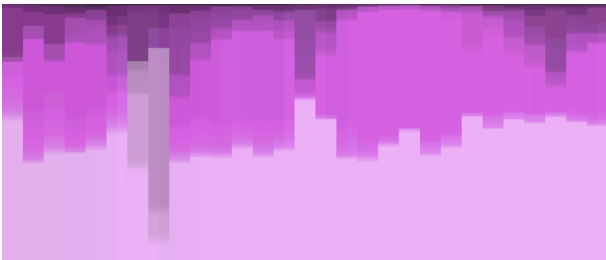
Figure 2. Visualization

Remote connections are achieved through WebRTC [4], where each client is a peer in a mesh network, and a server is used only to facilitate discovery among clients. Connections among clients are then peer-to-peer.