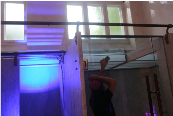
Figure 3. First public physical performance

Squidback is also available on the Internet [1], where it is present as a permanent web installation. Differently from online scheduled performances, users can connect and disconnect at any time, and choose whether or not to share their sounds with other potentially connected users.