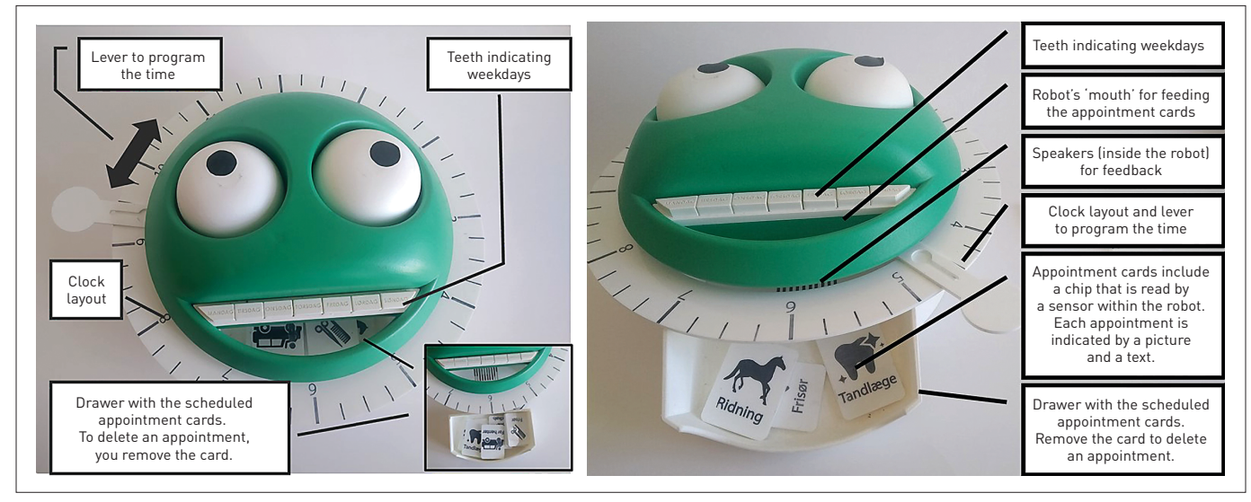
Figure 1. The Reminder Robot.

as acting in isolation, working autonomously, and replacing human work. Thus, we often respond skeptically when asked whether robots will, for instance, autonomously fulfill eldercare tasks and replace care workers. A key issue here is the word