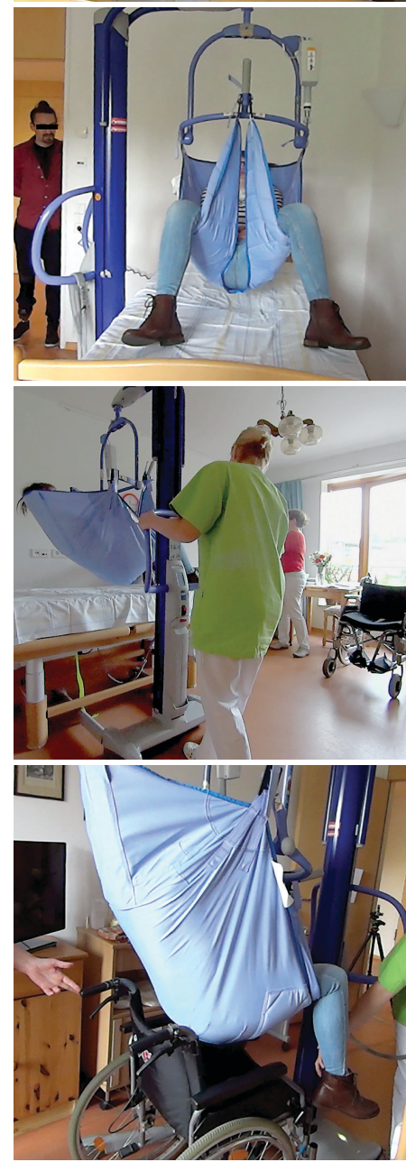
Figure 3. Video stills from the trial, with researchers taking the position of a resident being moved from a bed into a wheelchair with the passive sling lift Maxi Move. First, they are rolled onto the net, which is then attached to the lift, lifted up, turned around, and lowered into the chair.

For deeper insight into the process of lifting, researchers engaged in an autoethnographical trial, taking the position of residents and being moved around by two staff members who had volunteered for the session. Most relevant for HRI is a battery-powered, remote-controlled passive sling lift ("passive" in that the resident does not lift themselves up) that lifts immobile bedridden residents who have little control over their body or physical strength. The resident is rolled on their side and into a net, then lifted into a wheelchair or reclining chair; later they are lifted back into bed (Figure 3). The session was videotaped, which allowed a microanalysis of interactions as well as comparison with field notes, revealing that staff adopted the same kinds of routines and conversational patterns with the researchers as in their daily practice.