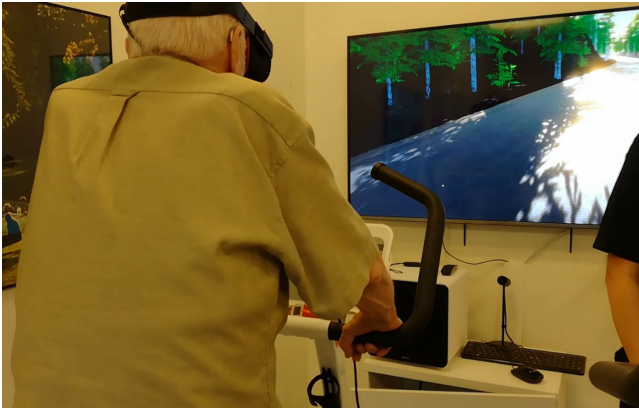
Figure 1: Participant during a VR-session, currently biking with low intensity.