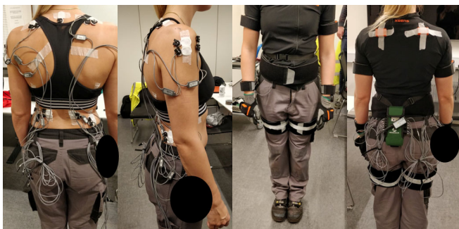
Fig 1. Experimental setup with sEMG and IMU sensors.

While participants performed the task, with (and without) ShoulderX, (95 th percentile) and median muscle activity was measured bilaterally with surface electromyography (sEMG) for shoulder and lower back muscles (Noraxon telemyo 2400 G2) at a sampling rate of 3000 Hz. Simultaneously, and synchronized with an inertial measurement unit (IMU) motion capture system, Xsens Awinda (Xsens Technologies BV) sampling at 60 Hz, used to capture task kinematics.