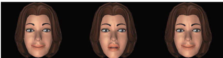
Fig. 1 Greta showing genuine joy ( left ), genuine disgust ( middle ), and disgust faked by joy ( right )

An example of such a rule for the superposition of two felt emotions (sadness and anger) is the following the more one of the input expressions is (similar to) anger and the other input expression is (similar to) sadness, the more certain is that the final expression contains brows, upper eyelids, eyes, and the lower eyelids of the first expression and the mouth area rest of the second (see Fig. 2). The output of this module is a facial expression composed of parts of the facial expression of one emotion and parts of the facial expression of the other emotion. They refer to this final expression as a complex expression as it is composed of two expressions and thus shows two emotions.