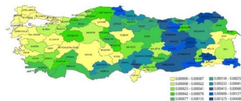
Figure 2. PRF values of Hydro

The values of the calculated PRFs were given in Figs.2-6. The high values of PRF indicate that the fuel is not used effectively. A high PRF value means that energy source can be a solution for heating and cooling. For hydraulic energy provinces such as Elazığ, Bingöl, Gümüşhane and Artvin are interesting (Fig.2). For solar energy, provinces such as Konya, Nevşehir and Niğde in central Anatolia are the forefront, and Şanlıurfa and Adıyaman provinces in southeast Anatolia (Fig.3).