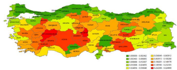
Figure 3. PRFvalues of Solar