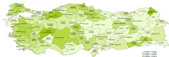
Figure 4. PRF values of Bio