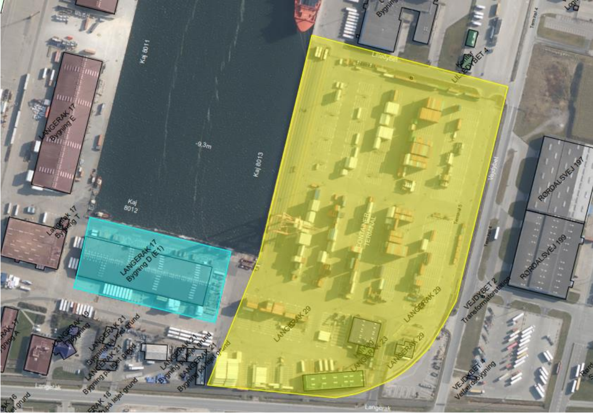
Figure 1 – The area for an intermodal, automatic, green terminal area. Marked with blue is the area for a RORO terminal and parking (currently a warehouse). Marked with yellow the area for container handling including a fenced automated area. Included in the yellow area is a rail network (right/east)

Port of Aalborg is a modern inland port with a 360-degree view, multimodal logistics solutions, and a focus on supporting the realization of Aalborg Municipality’s business and sustainability strategy. It is located outside the city centre on the open plains - with room for long-term development.