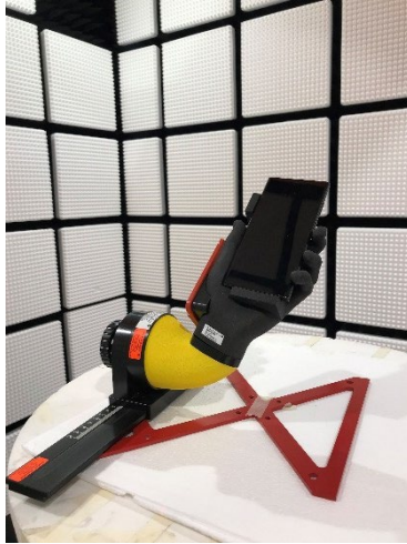
Figure 5: Data mode with phone placed in the left-hand phantom (LH).