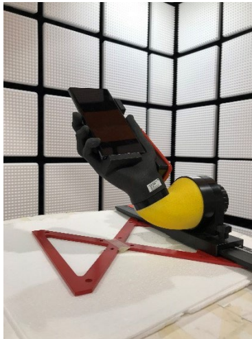
Figure 4: Data mode with phone placed in the right-hand phantom (RH).