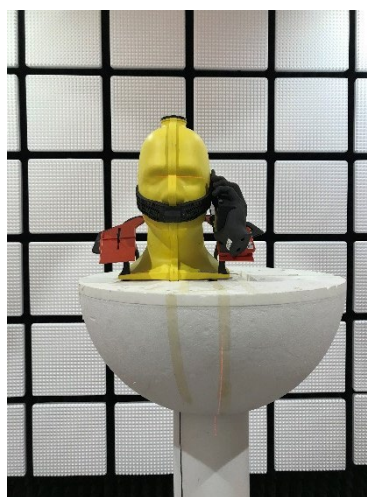
Figure 2: Voice mode with phone next to the left-hand side of the head phantom placed in A left-hand phantom (beside head hand left – BHHL).

The test procedure for 5G NR measurements is different and new. Two extra pieces of communication equipment (see appendix I) and one more antenna probe are used to perform the measurements. First an LTE connection is established followed by a switch to the NR band. In our 5G measurement, the NSA mode is deployed due to the lack of an end-to-end standalone 5G network. As a 5G test is not standardized by CTIA currently, the results for 5G are provided as informative data.