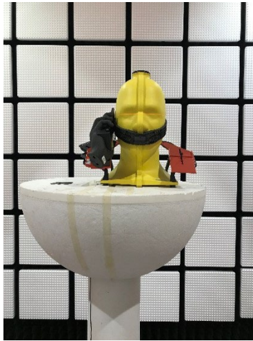
Figure 3: Voice mode with the phone next to the right-hand side of the head phantom placed in the right-hand phantom (beside head hand right – BHHR).