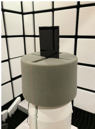
Figure 6: Voice and data mode with phone placed in free space (FS).